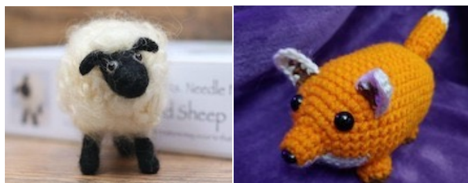
Needle Felted Sheep

But, since I'm not a weaver, my ongoing thoughts have been, "what could a weaver make?" Please – blow me away with your creations in April!